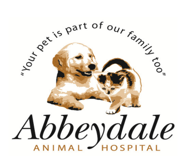
Feline Preventive Healthcare Plans